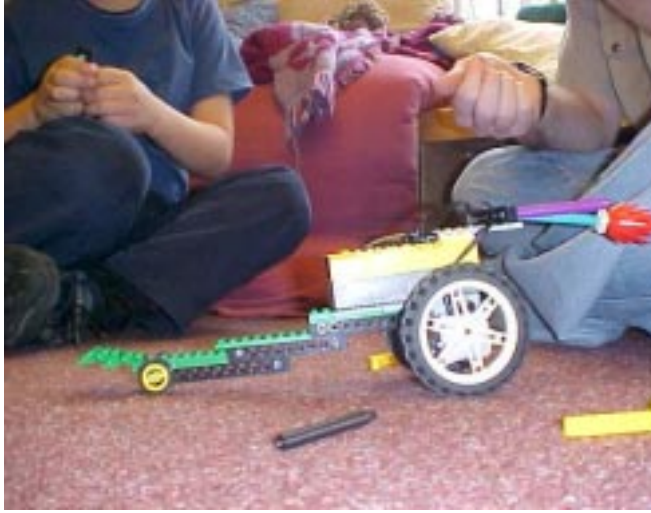
Figure 7. The dinosaur’s structure with its tail

make is stable” (Figure 7). The group accepted this and children engaged in an iterative design/building/programming process.