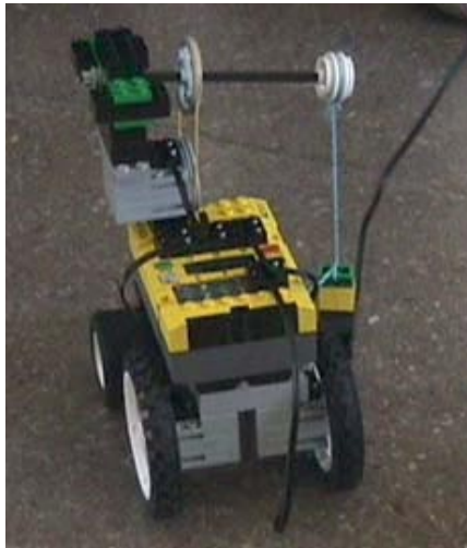
Figure 1. The RCX programmable brick with wheels, motors, and sensors

This technology consists of both hardware and software. The hardware is composed of the LEGO Mindstorms RCX, a tiny computer embedded in a LEGO brick (Figure 1). This autonomous microcomputer can be programmed to take data from the environment through its sensors, process information, and power motors and light sources to turn on and off. An infrared transmitter is used for sending programs from the computer to the Mindstorms RCX. The Mindstorms RCX has been the result of the collaboration between LEGO and researchers at the MIT Media Lab.