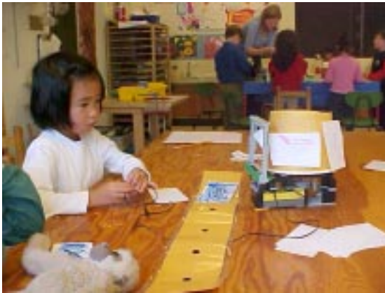
Figure 6. A girl controlling the robotic wheel with her own drawings of the life cycle

The robotic contraption was used at the beginning of the unit to gauge what children knew about the life cycle and at the end of the unit to see if they could generalize what they learned about tadpoles to other animals. Children were not engaged in either the engineering design of the wheel, or the programming of its movement. However, they were in charge of controlling the contraption and deciding the chronological order of the stages of a tadpoles' life cycle by operating the wheel and its motion (Figure 6). They were very motivated to engage in the activity because of their interest in learning about the gears and the functioning of the technology.