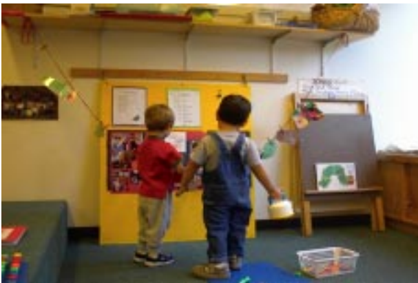
Figure 3. Children playing with clothesline representing stages of metamorphosis

Prior to this project all 12 children were unable to identify the phases of metamorphosis. For example, while reading the Hungry Caterpillar storybook (Carle, 1969) and playing with a clothesline that depicted the stages of the story for the children to look and play with, one boy told to his friend: “Look there are two animals here! A caterpillar and a butterfly!” (Figure 3). This little boy did not understand the concept that the insects were one and the same. By the end of the project, however, the majority of the children understood that although the exterior of the caterpillar changed throughout the phases, it was still the same insect. In fact, eight of the 12 children were capable of labeling the entire sequence.