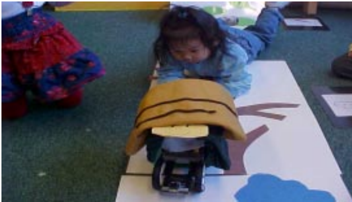
Figure 4. A three year old mounting a cocoon puppet on a robotic heart

Children were asked to design the three environments that the caterpillar would move through its life cycle: the leaf environment, the branch environment, and the cloud environment. The environments were laid in order on the floor and children took turns placing the corresponding puppets on the Lego heart as it moved through the environments (Figure 4). The children had a great time watching the heart move across their created environment and helping the metamorphosis happen right before their eyes.