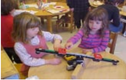
Figure 5. Children suggesting to each other where weight should be added

First the child needed to figure out a way to make the magnet side of the crane more weighted so it could pick up magnets off the table. Next the child had to balance the crane for it to rotate over a short wall without hitting it. Once on the other side, the child needed again to redistribute weight for the magnet to touch the table or floor surface. The child was encouraged to go back and forth delivering magnets for as long as he or she wanted to.